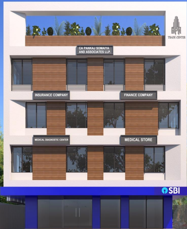
FRONT VIEW (Bahadarpur Road)